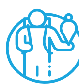
Meetings with travelers