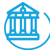
Monuments in Poland and abroad