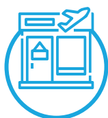
Travel agents from Poland and abroad