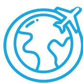
Tourist states and regions